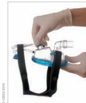
NovaStar® TS NIV full-face mask