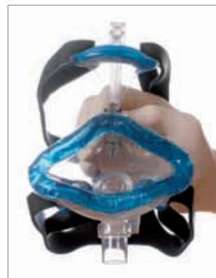
Pliable and adjustable mask body for individual adaptation to the patient's face - mask stays in position