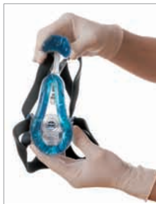
Pliable and adjustable forehead support – mask stays in position