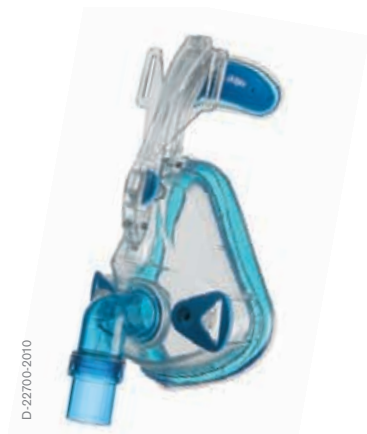
NovaStar® TS NIV full-face mask with Standard Elbow