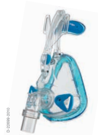
NovaStar® TS NIV full-face mask with Anti-Asphyxia Valve